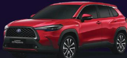
RED MICA METALLIC