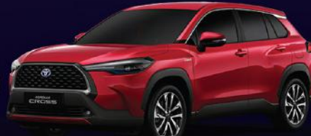
RED MICA METALLIC