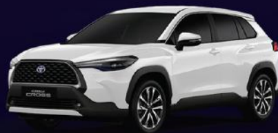
PLATINUM WHITE PEARL MICA