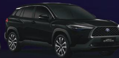
ATTITUDE BLACK MICA