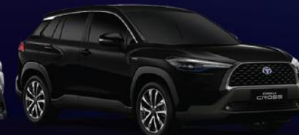
ATTITUDE BLACK MICA