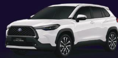
PLATINUM WHITE PEARL MICA