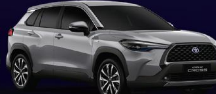
METAL STREAM METALLIC