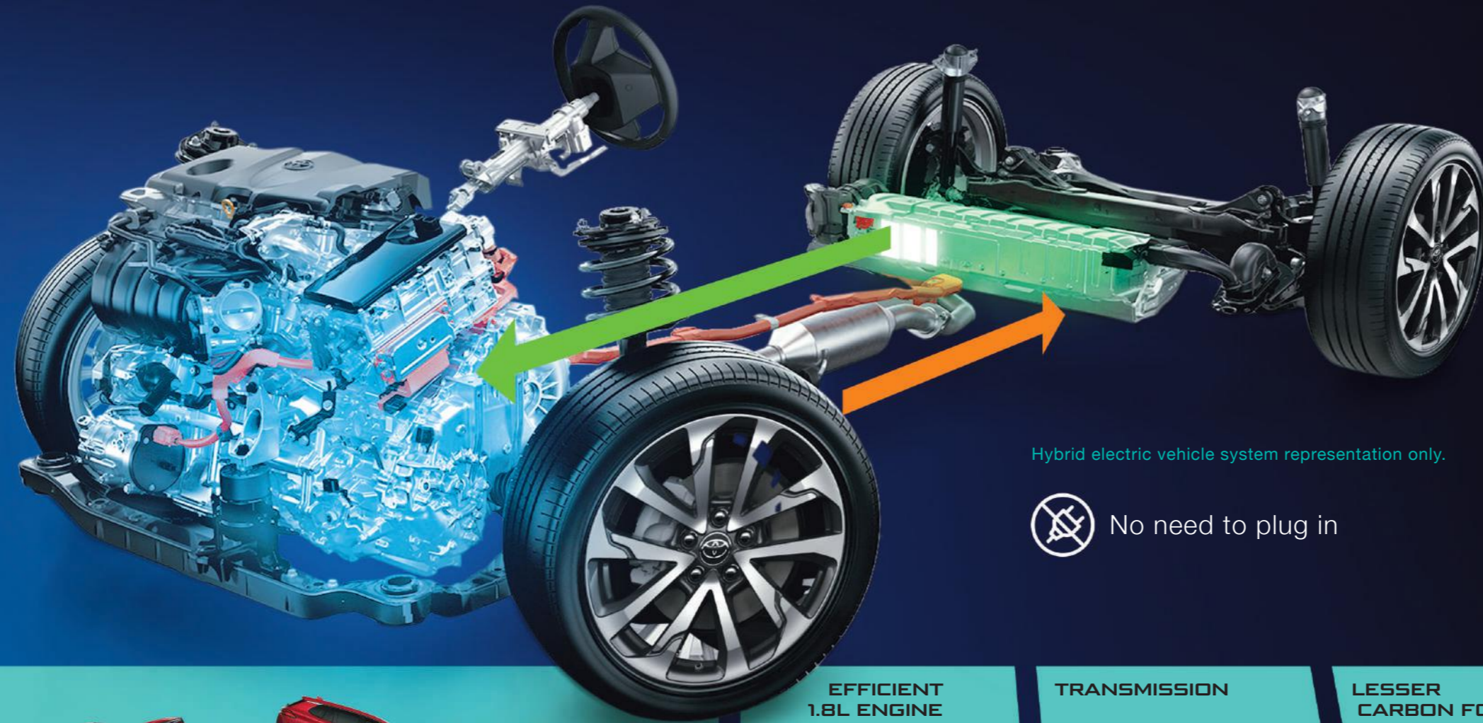
Hybrid electric vehicle system representation only.

Experience the seamless combination of an efficient gasoline engine and a self-charging, high-output electric motor for maximum fuel mileage. Now that's advanced Hybrid Technology in one sleek package.