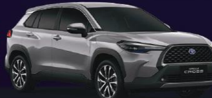
METAL STREAM METALLIC